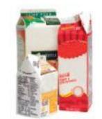
Milk cartons, juice cartons and aseptic containers