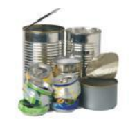
Aluminum, tin or steel cans, foil and pie tins