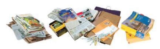
Cardboard (flattened), office paper, file folders, magazines, catalogs, newspaper and inserts, junk mail, telephone books, etc.