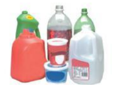
Plastic bottles and containers